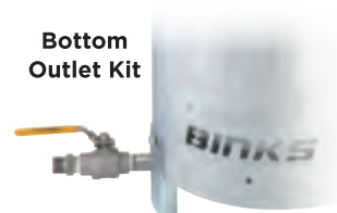
Bottom Outlet Kit

183-3005: One leg plus fasteners. Order one to replace a damaged leg. Order three to raise a tank without bottom outlet plumbing.