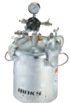
2 gal. PART NO.: 183G-210