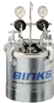
w/ 2 Regulators PART NO.: 83C-220

(D) =Direct Drive Agitator: Uses direct mount air motor and air adjusting valve.