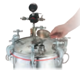
All 183S Tanks Include Fill Port