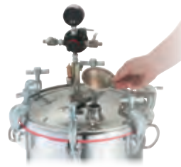
All 183G Tanks Include Fill Port

Binks 183G- ASME Code Tanks give you application flexibility for most solvent-borne applications.