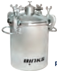
Binks 2 gal. Solvent Saver Galvanized Steel, Aluminum & Brass Construction PART NO.: 183GZ-5200