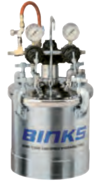
w/ Agitator (2 Regulators) PART NO.: 83C-221