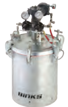
5 gal. PART NO.: 183G-523