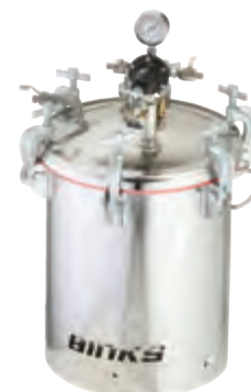
5 gal. PART NO.: 183S-510